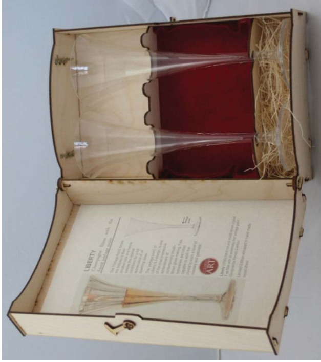
Liberty encased in a Clearly Art exclusive gift chest COFFLU

The 'Périlage Point' is the pointy bottom of the flute that forces the bubbles to their smallest size and hence creates the optimal conditions for a full appreciation of all sparkling wines. The 'périlage point' of Liberty & Asburgo is one of the most impressive achievements of contemporary mouth-blown glass making. Few companies are today capable to work the crystal to such a level of mastery and precision.